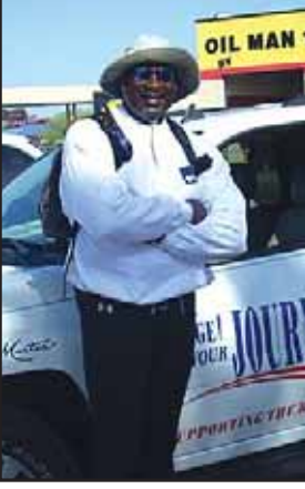
see page A-3