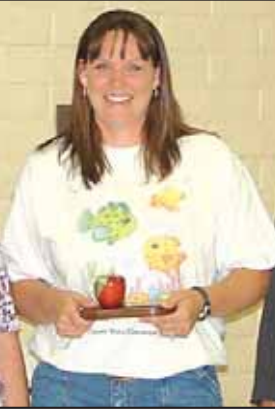
see page A-6