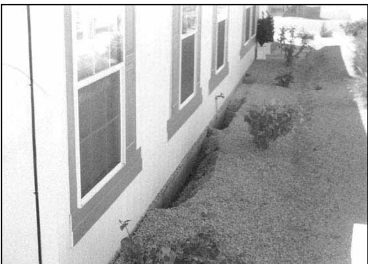
Sinkholes, as pictured above, plague homes in the Desert Harbor community.

When residents purchased their brand new homes in the adult manufactured home community of Desert Harbor, 3700 S. Ironwood Dr. in Apache Junction, they thought they were buying into a relaxing community where they could enjoy a peaceful lifestyle and the freedom of retirement, instead, they found themselves locked in the battle of their lives to protect the investment they have in their homes, which are shifting and sinking in unstable soil.