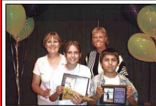
Four Peaks Selects "Athletes Of The Year," see story, page C-2