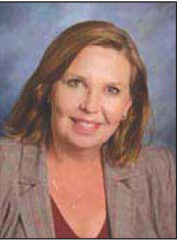
see page A-5