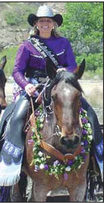
see page A-3