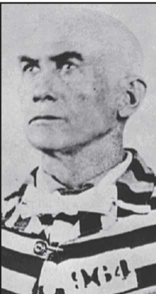
see Kollenborn, page A-4