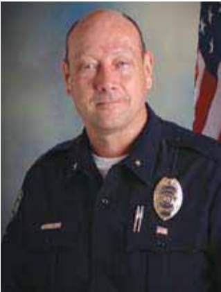
see page A-3