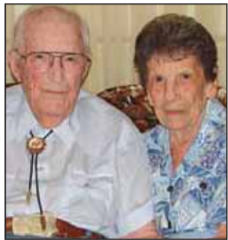
see page A-6