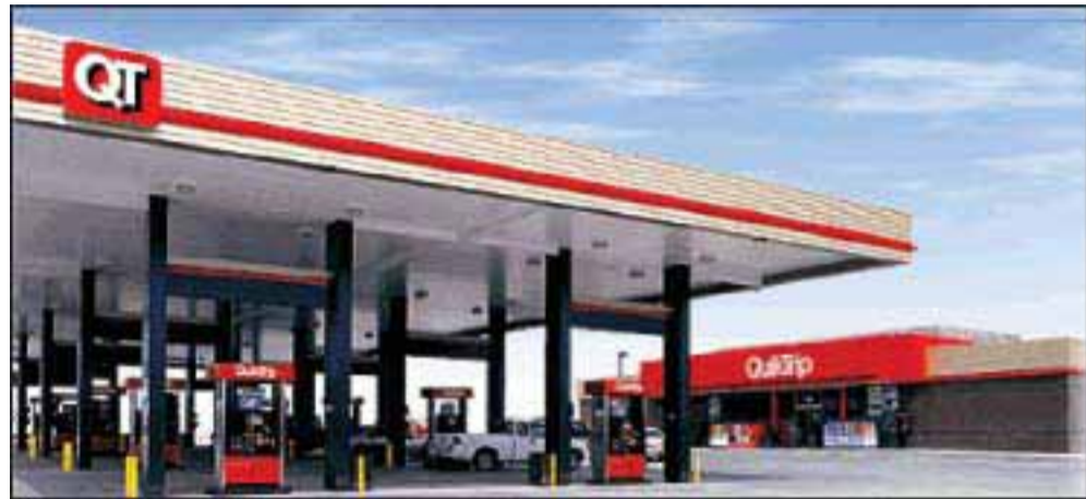
QuikTrip would like to build a gas station/convenience store like the one pictured above on the northwest corner of Baseline Avenue and Ironwood Drive.