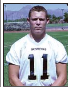
A.J. Football Players Shine At Combine, see story, page C-2