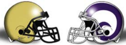
(helmets courtesy of www.azhelmetproject.com )