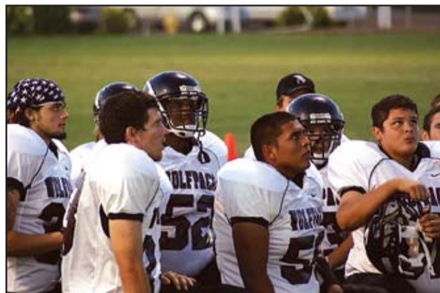
The Wolfpack players are all ears as they listen to the coaching staff prior to one of their recent games.

where you can view pictures from other games.