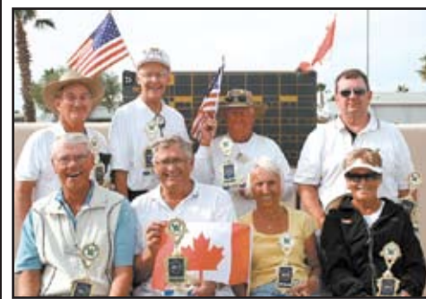
Can-Am Champs, see B-2