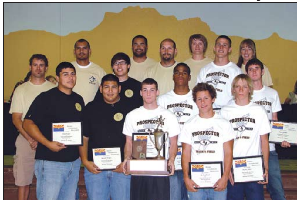
Members of the AJHS boys track and field team and coaches being recognized at a school board meeting after capturing the first State Championship title in school history May 9 and 10 at Mesa Community College.