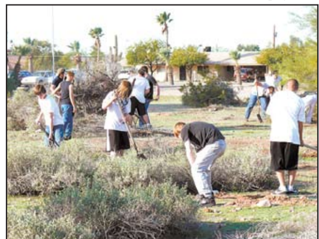
Students from Apache Trail High School, all members of the Wolfpack football team, gave up their January 19 holiday to clear brush from a field just south of the school in preparation for a practice facility