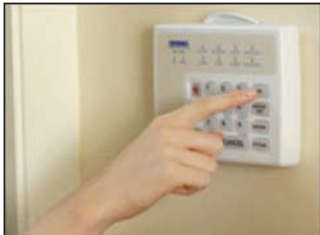
With an estimated 25% annual increase in alarm systems nationwide, police departments and county sheriff offices are overwhelmed with false alarm calls.

The Pinal County Board of Supervisors adopted an alarm system ordinance, effective January 1, 2003, to regulate the amount of false alarms that occur. All alarm users are required to obtain an annual alarm permit, which costs $10. Permits are renewed an-