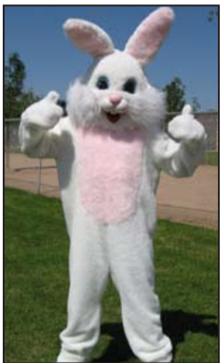
see page A-10