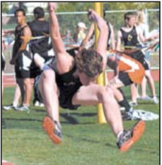
see Sports, B-1