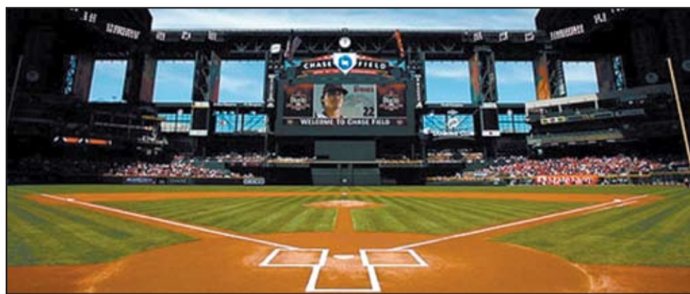
Chase Field, home of the Arizona Diamondbacks, will be the host site of this Wednesday's Apache Junction vs. Glendale Independence varsity baseball game.