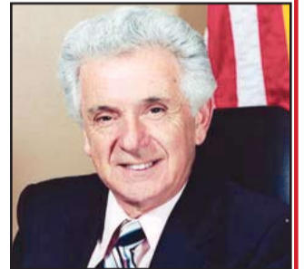
Mayor John Insalaco