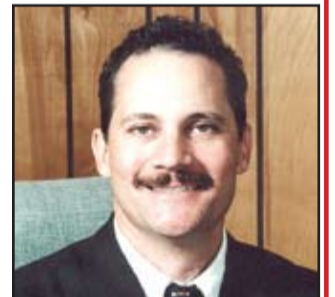
Vice Mayor R.E. Eck