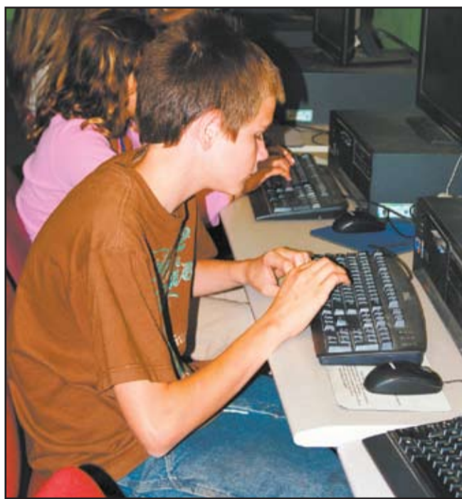
Students at the Boys and Girls Clubs of the East Valley, Apache Junction Branch, work on computers during their summer break.