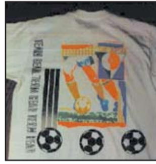
Above and below, reproductions of "Jane Doe's" clothing

Anyone who may have any information regarding the