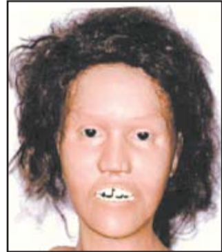
The reconstructed face of "Jane Doe."

The victim was wearing a large "Team Gear" brand T-shirt with soccer balls imprinted on the front and back of the shirt. The victim was also wearing a pair of Levis denim cutoff shorts and a ring