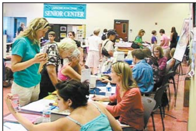
The Multi-Generational Center will host more than 70 different booths focused on improving the wellness of you and your environment.