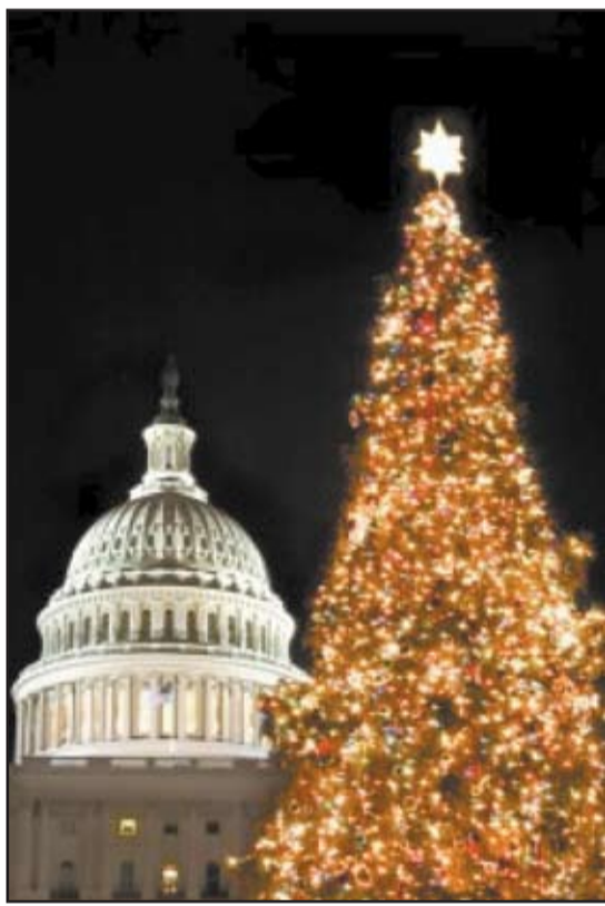
Arizona has been selected to provide the U.S. Congress with the Christmas tree.