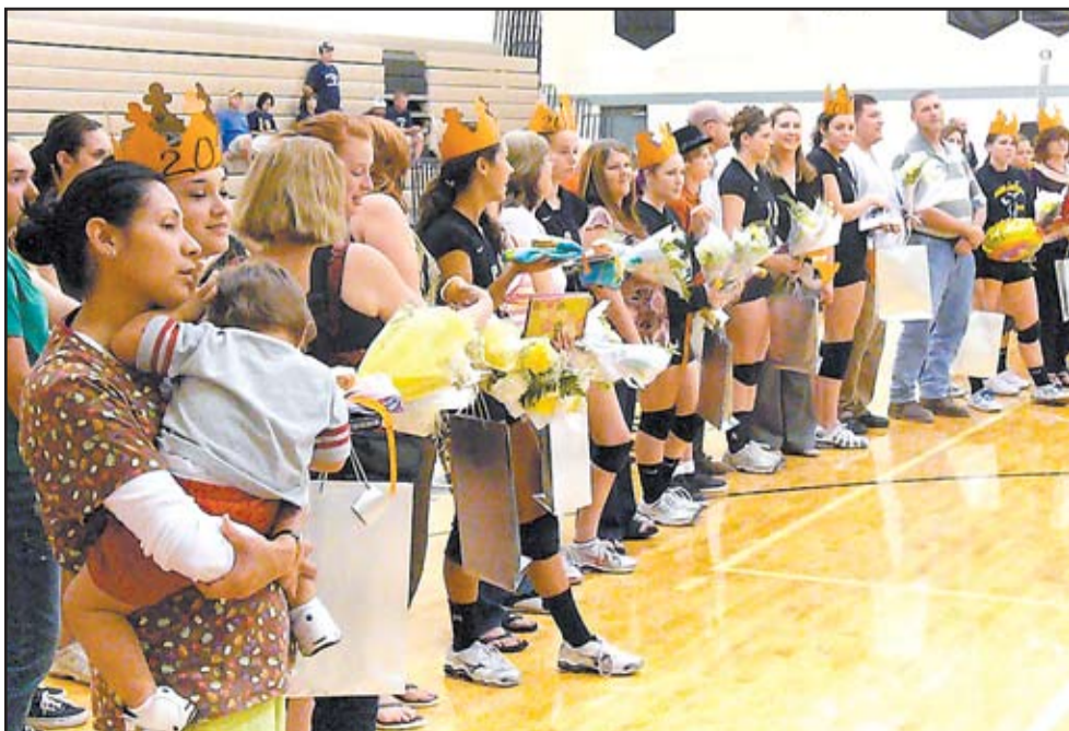
The ten seniors on the Lady Prospector volleyball team were honored prior to their match last Tuesday against (Glendale) Raymond Kellis. The AJHS girls defeated Kellis in straight games and will play this Tuesday in the 4A-I State Tournament.