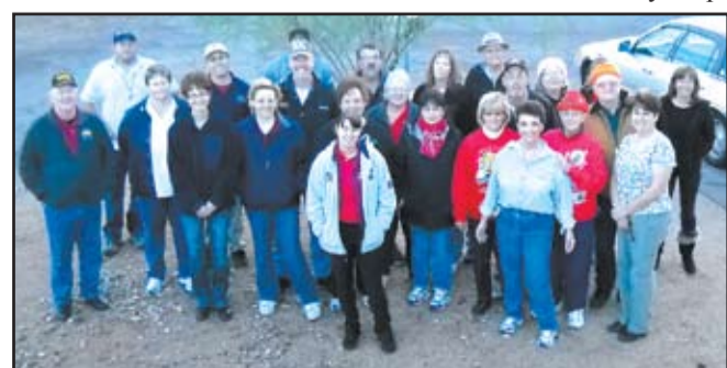
Santa’s Helpers in the form of AJUSD Transportation Department employees not only collected all of the toys, food and clothes, but helped unpack them at Project HELP as well.

to the following local agencies and businesses: Apache Junction Fire District, Pizza Hut, Apache Junction Chamber of Commerce, Walgreens in Gold Canyon, Crow’s Nest, Cobbs Restaurant, Village Inn, Bank of America, Meridian Manor MHP, Kmart at Power Rd. and Hampton, Feed Bag Restaurant, Dirtwater Springs, Filly’s Roadhouse, Los Gringos Locos, Vista Medical Center, Gentle Dental, Pueblo MHP, Dollar General Store, Holiday Inn, Chase Bank, AJ Urgent Care, Food City, Gloria’s Beauty, City Signs, Home Depot, Bashas’ in Gold Canyon, Bashas’ on Signal Butte & Apache Trail, Fry’s in AJ, Safeway at Meridian & Apache Trail, UFB Skate Shop, Cimmarron MHP, staff and students at Apache Junction High School, Desert Shadows Middle School, Thunder Mountain Middle School, Desert Vista Elementary School, Gold Canyon Elementary School, Superstition Mountain Elementary School, AJUSD District Office personnel, Maintenance Department, Food Services Department, and the Technology Department.