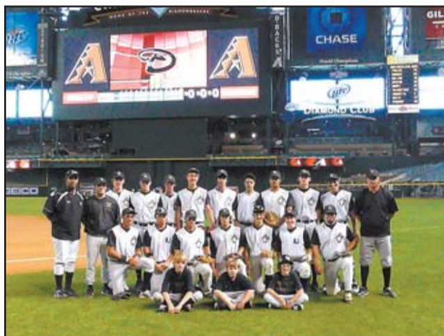
The Prospector varsity baseball team pictured inside Chase Field on April 22 for a special, thrill-of-a-lifetime game against Glendale Independence

Independence struck first in the game, scoring a run in the bottom of the second inning but the Prospectors bounced back with three runs in the top half of the third inning, the key hit a triple to the wall in center field by the Prospectors