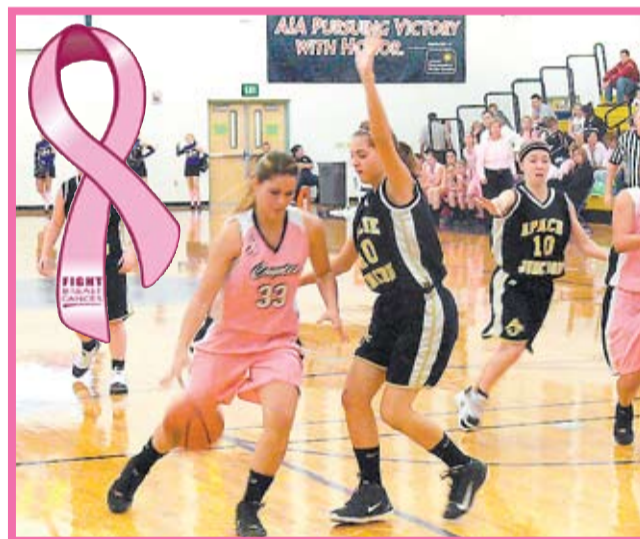
The Lady Prospector basketball teams will be wearing these same pink jerseys that Queen Creek wore when they hosted Apache Junction back on January 8 during this Tuesday's home games with Queen Creek in support of Breast Cancer Awareness. The jerseys are borrowed from neighboring Mesa Skyline High School.