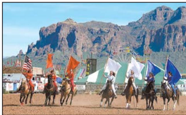
(above) The Lehigh Lariat Drill Team from Mesa kicked off last Friday's Lost Dutchman Days Rodeo