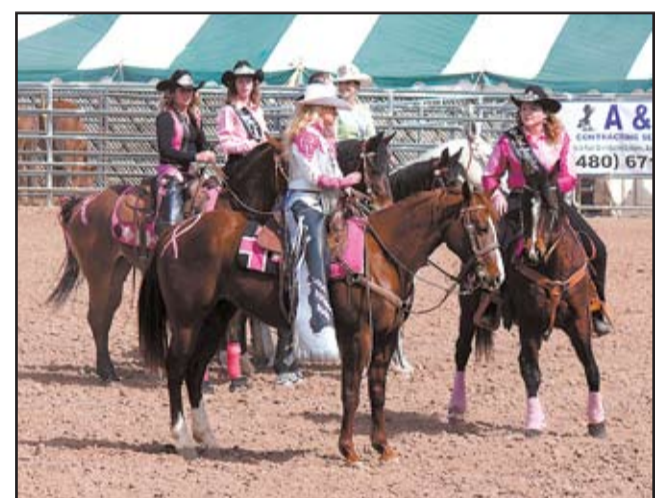
Lost Dutchman Days royalty are recognized just before the start of last Friday's Lost Dutchman Days rodeo