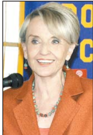
see page A-10