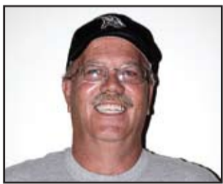
see Sports, page B-1