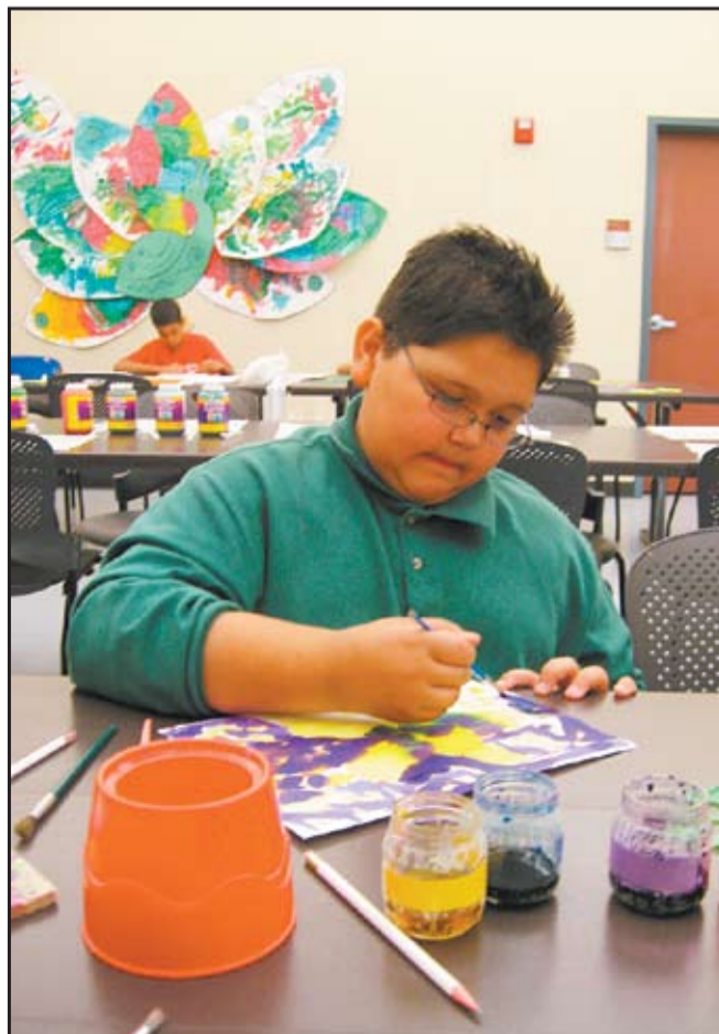
An Apache Junction child partakes in an art class during spring break.