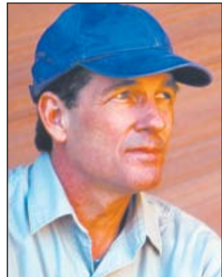
see page A-6