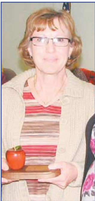
see page A-10