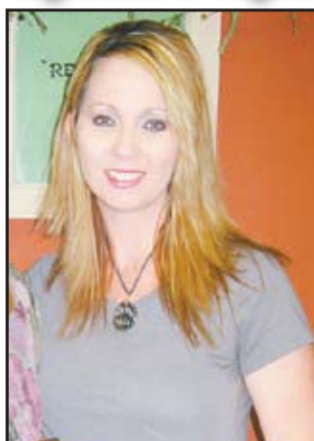
see page A-10