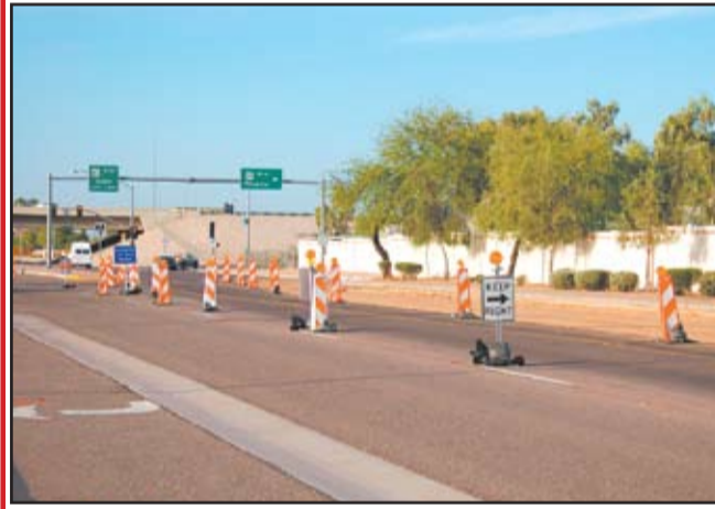
Construction is expected to last through August 12.

Construction on Ironwood Drive from U.S. Highway 60 north to 16th Avenue will continue through August 12, according to City officials.