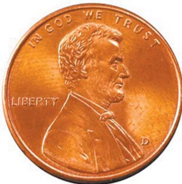
A ballot measure that calls for a temporary 1¢ state sales tax increase will be voted on this week.

"On May 18, a Sales Tax Special Election titled Proposition 100 will be held to give