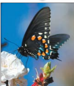
see page A-7