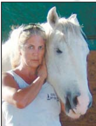
see page A-8