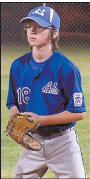
see Sports, page B-1