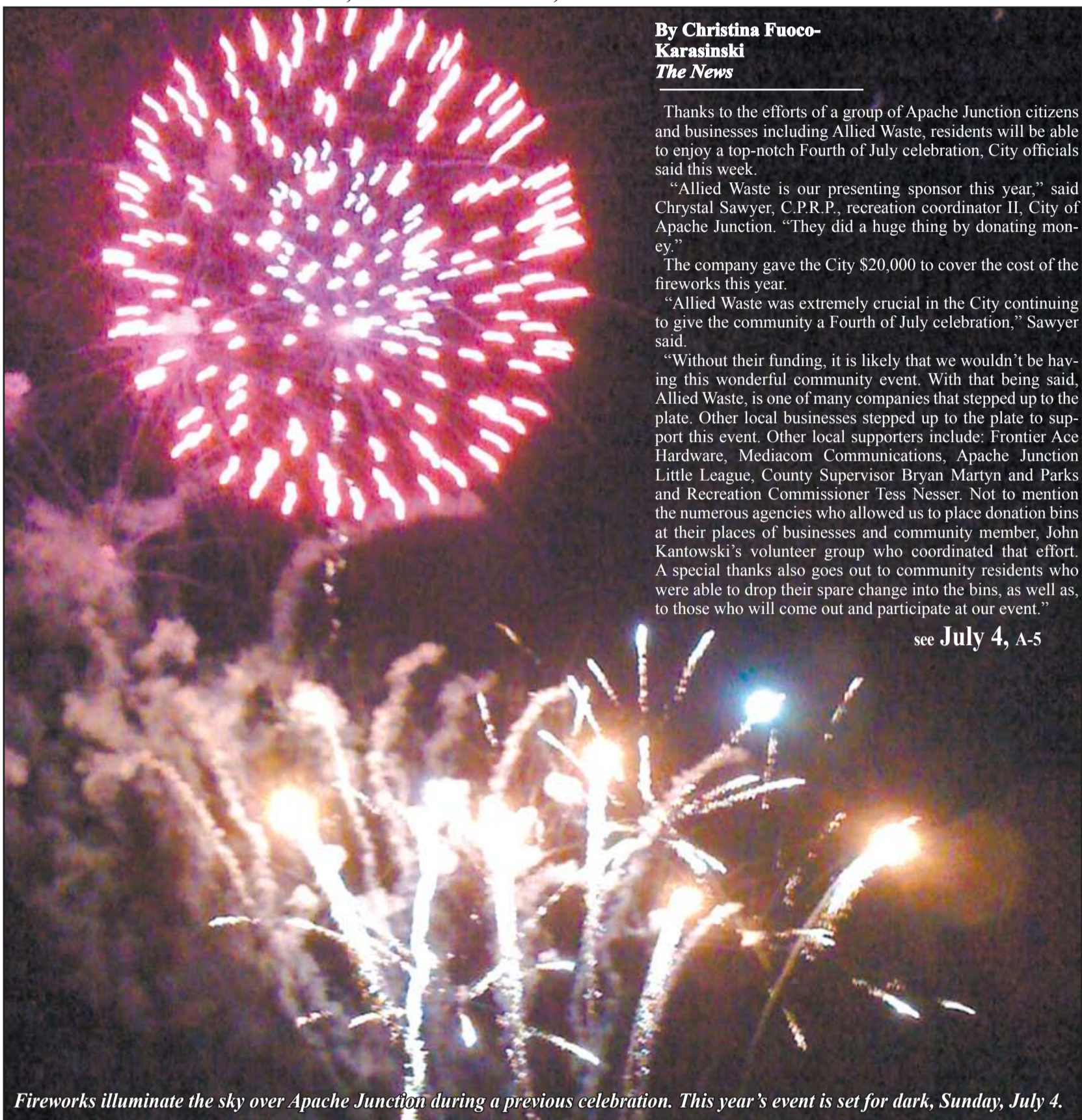
Fireworks illuminate the sky over Apache Junction during a previous celebration. This year's event is set for dark, Sunday, July 4.