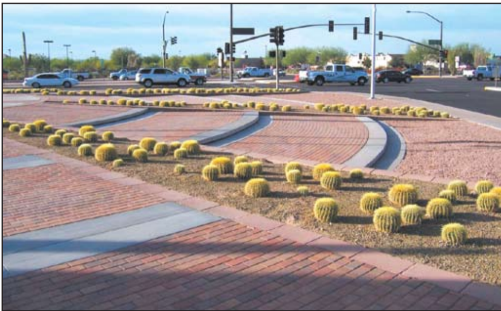
The Focal Point will be refurbished each quarter thanks to donations from the public.

For a donation of $530, one of the trees at the Focal Point or along Phelps Drive can be lit. Trees can be lit to commemorate a loved one, celebrate an anniversary or other