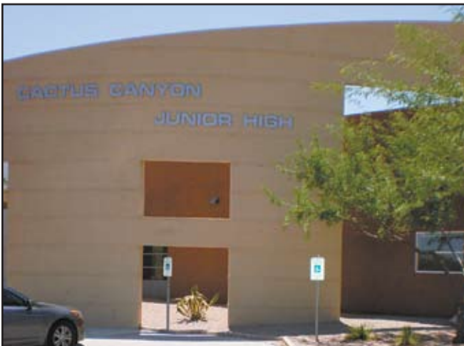
Everything is in place, including the new name, for the arrival of students and the opening of the new Cactus Canyon Junior High School on Monday, August 9.