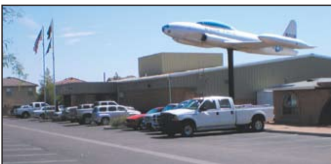
The Apache Junction American Legion Post 27 with its iconic jet fighter out front is the largest American Legion Post in Arizona.